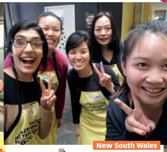
New South Wales