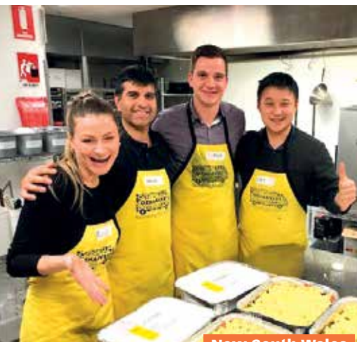
New South Wales

It was a stark reminder that no matter what part of the world you are from, there are always those who need a helping hand and there will always be those willing to help to make a difference. We did so because we care!