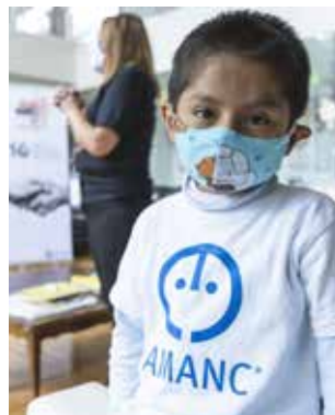
15 ↑ Nothing stops us!