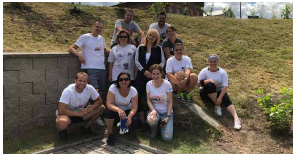
Aspen's team planted 60 trees at SeneCura Home