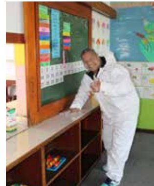
6 ↑ Supporting our future generation during COVID-19