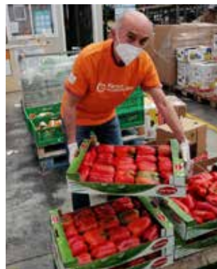
9 ↑ Working together to feed the hungry