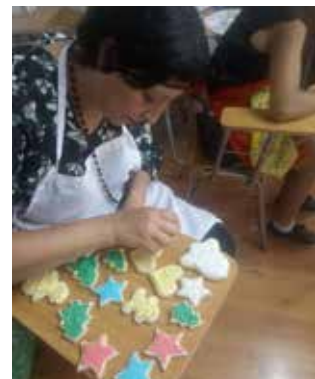
13 ↑ Entrepreneurship training for unemployed bakers