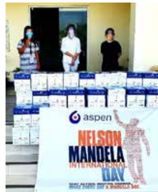
17 ↑ Continuing education during COVID-19