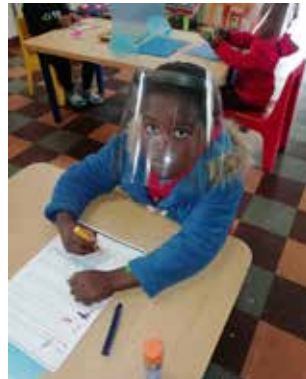
4 ↑ We Care during COVID-19