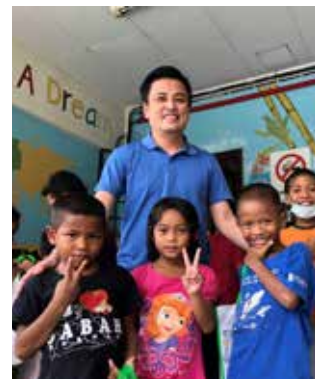
16 ↑ A brighter future for Orang Asli children