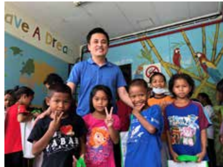
Pertubuhan Kebajikan Rumah Mega Kanak-kanak Orang Asli is a non profitable organisation

that was established in 2017 in Kuala Lumpur. Its purpose is to shelter less privileged children from rural areas. This centre is a place of safety that provides discipline, nutritious meals, accommodation and education in an urban environment. COVID-19 has, however, made it even more challenging for the centre and for these children to attend classes and to enjoy a healthier lifestyle.