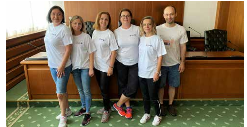
Aspen Slovakia's Mandela Day team