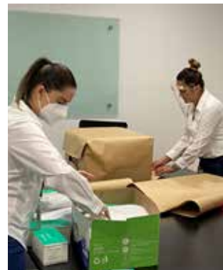
14 ↑ Supporting palliative care patients with PPE