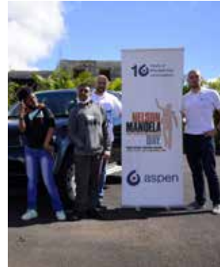
7 ↑ Ongoing support for the Ranger Foundation Trust